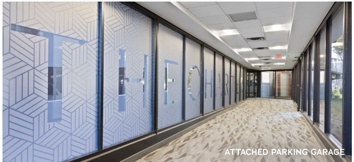
ATTACHED PARKING GARAGE