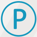
FREE ATTACHED PARKING GARAGE