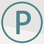
FREE ATTACHED PARKING GARAGE